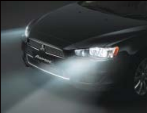
HID HEADLAMPS WITH AFS