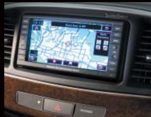
MITSUBISHI MULTI COMMUNICATION SYSTEM (MMCS)

Other features that do the thinking for you include Smart Key which provides key-less entry and operation, Dusk Sensing Headlamps and Rain Sensing Wipers.