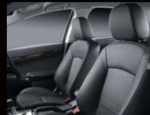
LEATHER TRIMMED SEATS