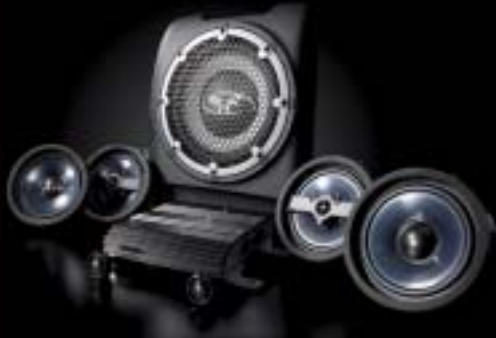
ROCKFORD FOSGATE® PREMIUM AUDIO SYSTEM