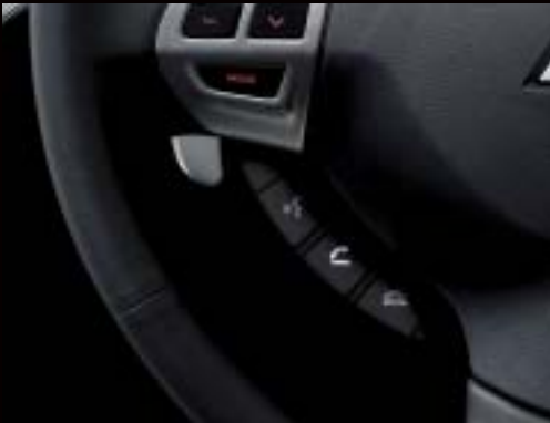
BLUETOOTH® PHONE CONNECTIVITY